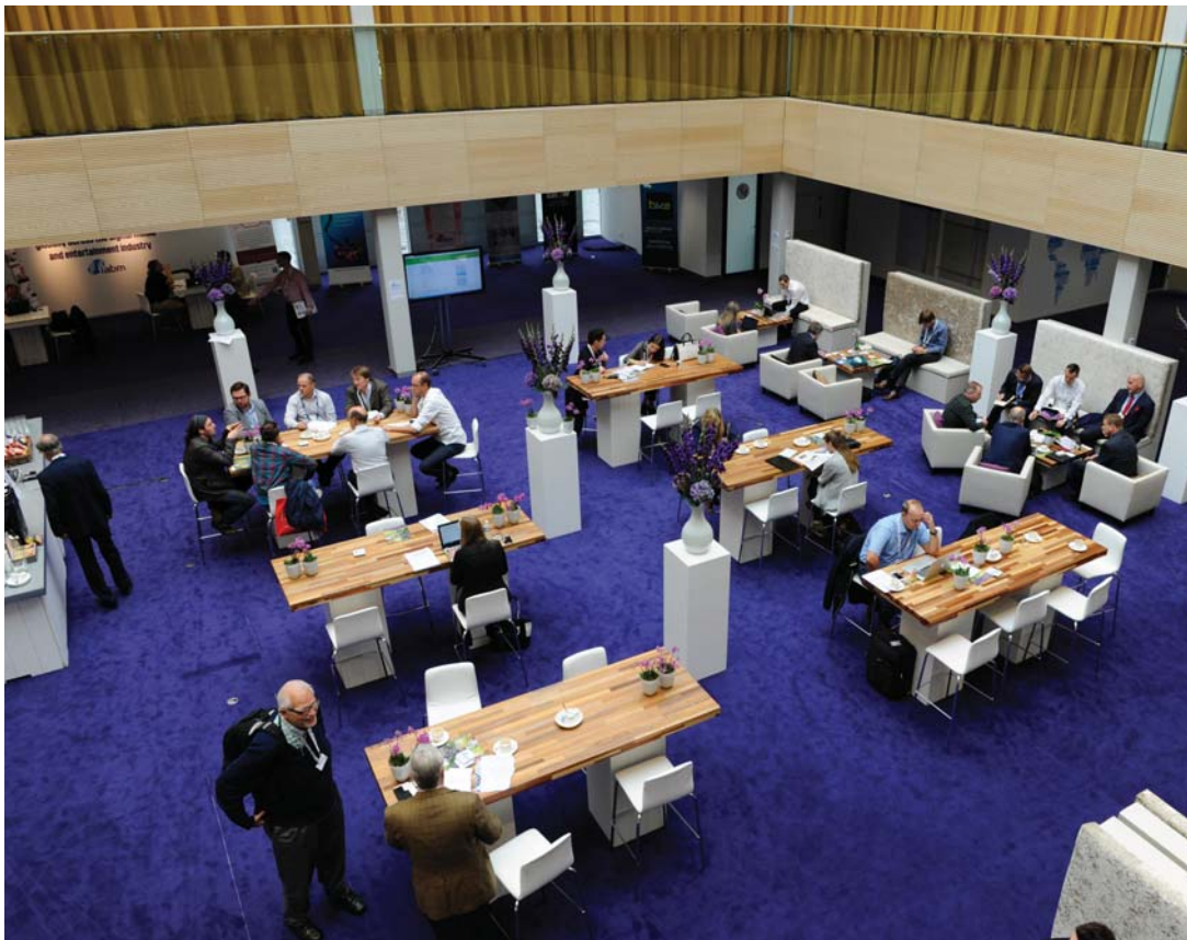
IABM Members' lounge at IBC

Give feedback to organizers of supported shows and recommend other shows