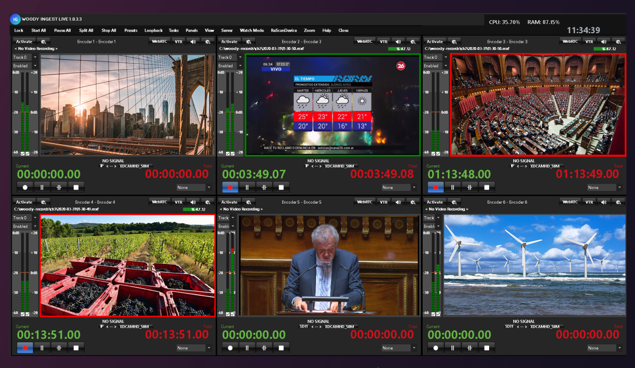
This product is developed in partnership with 🔀 Libero Systems