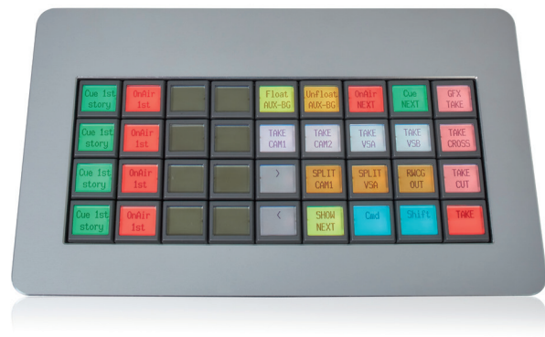
ASTRA Programmable Shotbox Control Panel