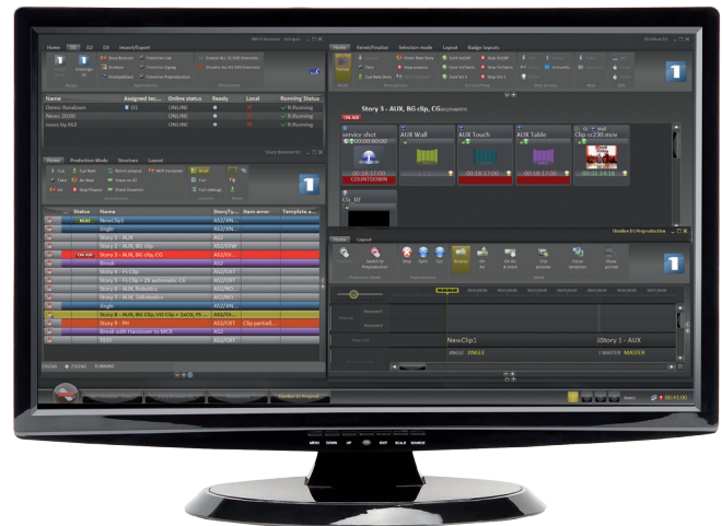
Rundown, shots and timeline

ASTRA Studio 3 works with your existing equipment. Aveco has the industry largest library of interfaces, supporting essentially all studio, PCR and MCR hardware and software.