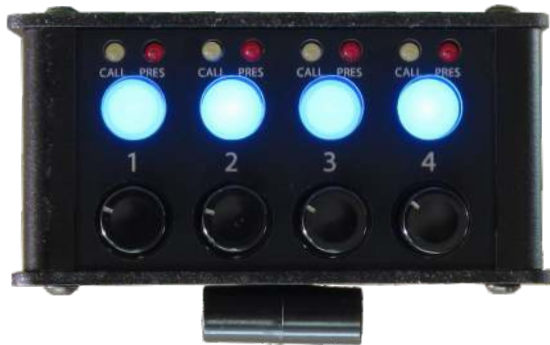
Beatrice B4+ Front