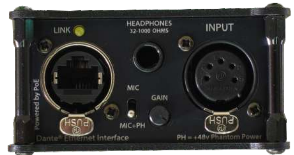
Beatrice B4+ Rear (pictured with optional 5 pin headset connector)